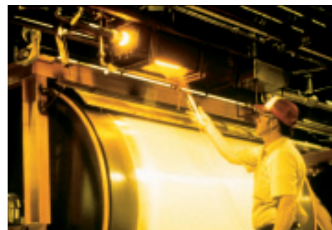
Continuous filament glass fibers are drawn from a furnace onto a revolving drum to form a dense, interlaced mat.

The chipboard filter frame, free of sharp edges, makes the panel easy to install and remove. After removal, the filter can be safely folded for compact disposal.