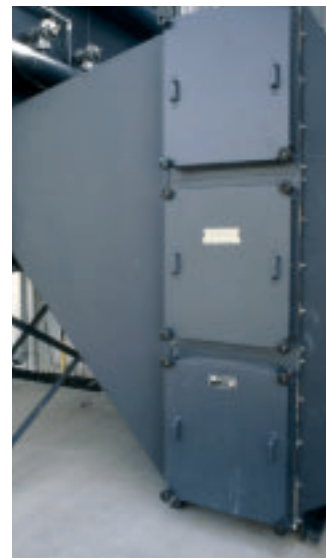
Three filter high BIBO installation.

The AirShelter BIBO can be easily installed by most commercial HVAC contractors. Skid-mounted, it is suitable for rooftop or indoor installation.