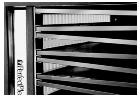
Side Access Carbon, side view, showing "V" bank trays.

Each Side Access Carbon tray is furnished with 45 pounds of activated charcoal per 1,000 CFM of rated capacity. The retention time of the gas stream at the rated flow of 500 FPM is 0.09 seconds. Retention time can be increased by installing multiple housings in series or in parallel, or reducing the flow rate. The trays have a removable end cap which allows them to be refilled with fresh adsorbent on site. If desired, the emptied trays can be returned for refill.