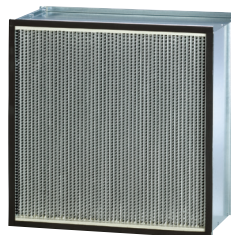
MEGAcel™ I HEPA filters are manufactured with high performance Nelior® membrane media and unique tapered aluminum separators.