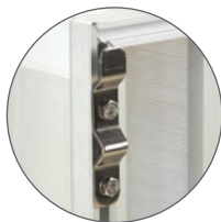
Gel Seal Frame Extractor Clips

AstroCel® III filters are designed for installation into high integrity filter holding frames, side access housings, and bag in/bag out systems including one piece urethane. Multiple gasket seal filters are available, as well as gel seal filters for frames and systems designed with knife-edge seal framing. Extractor clips are offered for side access systems requiring gel seal frames.