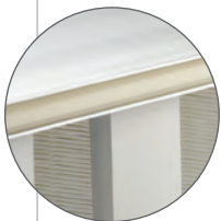
Gel Seal Frame