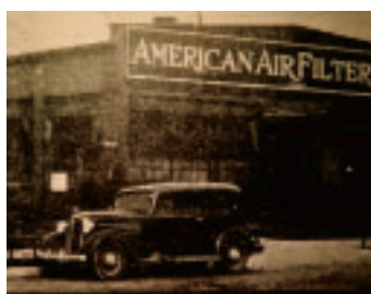
The American Air Filter Company became incorporated in 1925.

Headquartered in Louisville, Kentucky, AAF International is the world's leading manufacturer and marketer of air filtration products and systems. Selling globally under the AmericanAirFilter and AAF brand names, our products include commercial, industrial, and residential air filters; cleanroom filtration; air pollution control products and systems; and gas turbine filtration and acoustical systems.