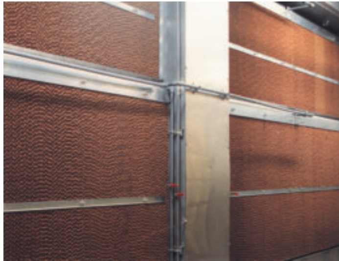
Humidification section in paint booth supply air system.

Our Total Filter Management (TFM) program developed to provide improved quality, reduced operating costs, and budgetary stability, establishes AAF as the single-source supplier for all paint shop filtration.