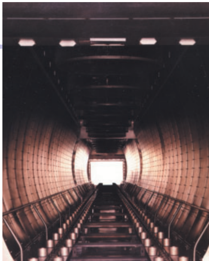
AAF provides high temperature air filtration for paint curing ovens.

AAF International's goal is simple: to provide single-source, quality filtration solutions for your facility in the most efficient, proactive, and cost-effective manner.