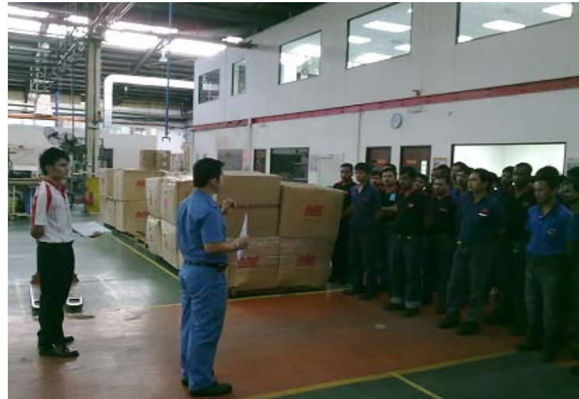
Convey Opening Message and Special Message to all factory workers.