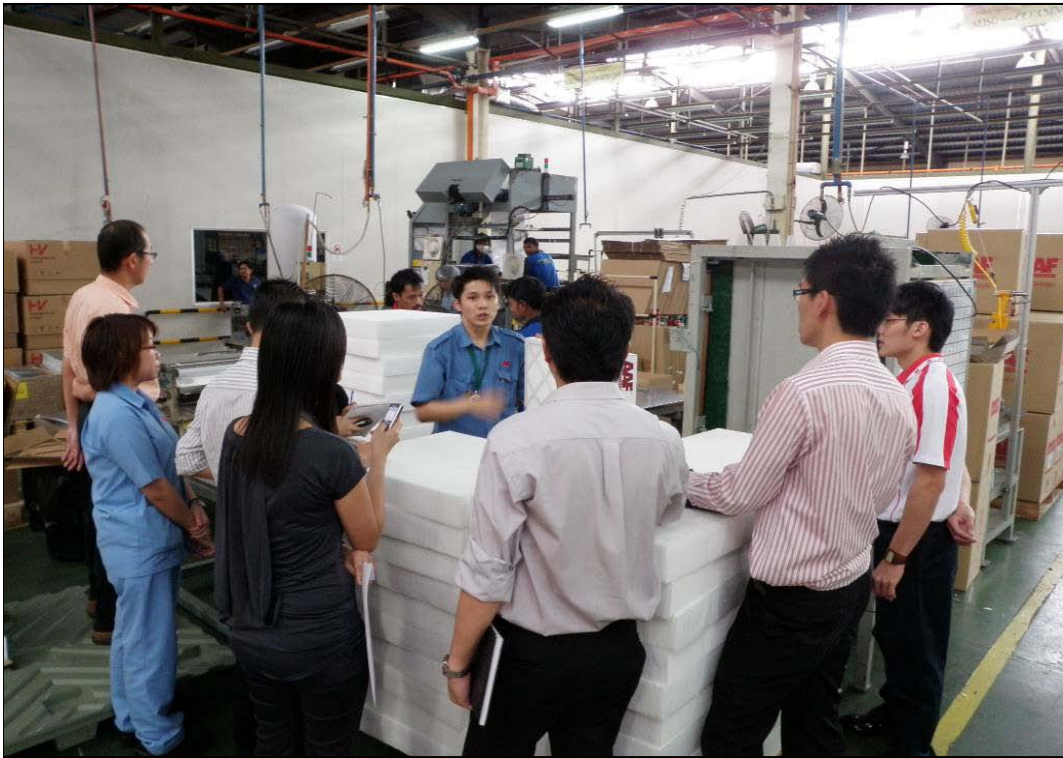
Explanation on filter quality checking procedures for VariCel-II products.