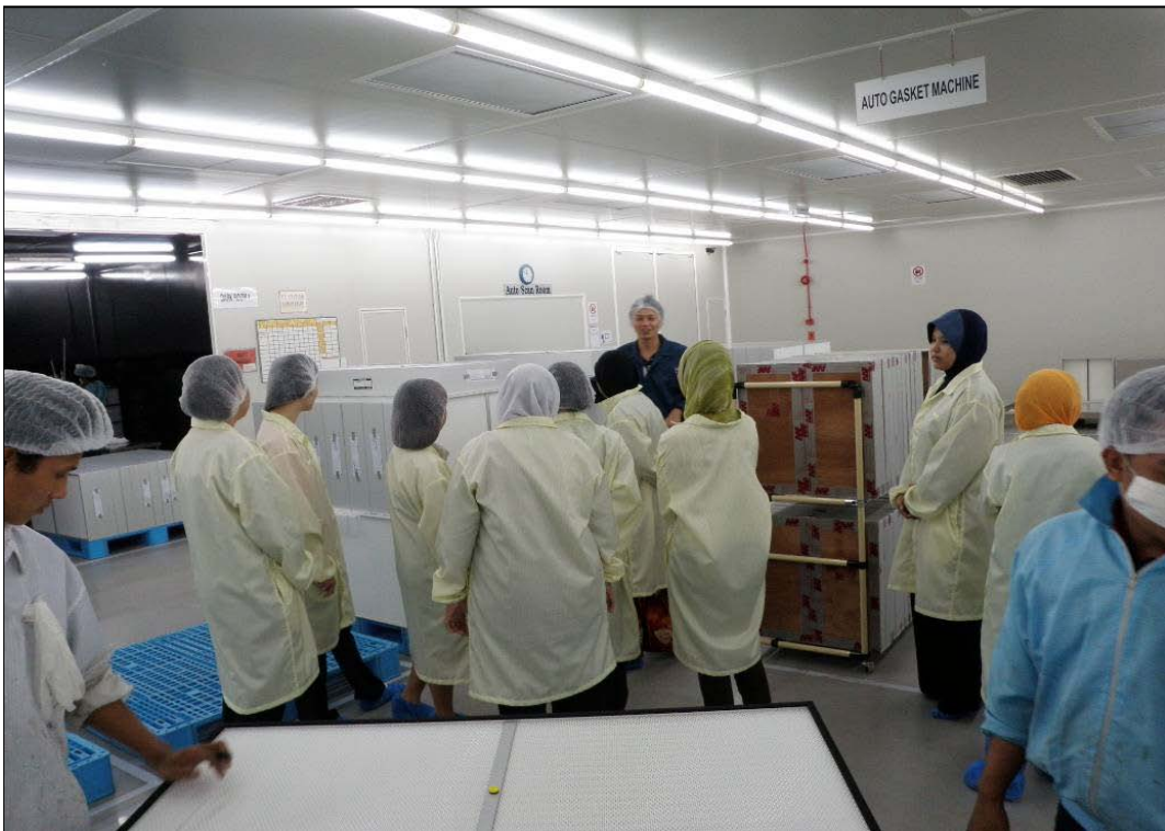
Participants contrate on explanation given by CleanRoom Supervisor on AstroCel-II Autogasketing process.