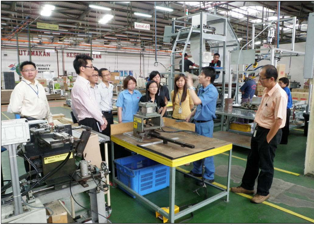
Participants learning the process flow of DRIPAK line.