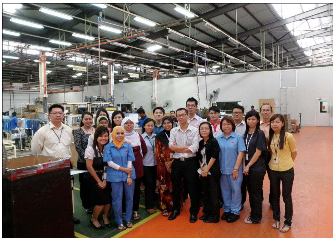
Participants Group Photograph Session