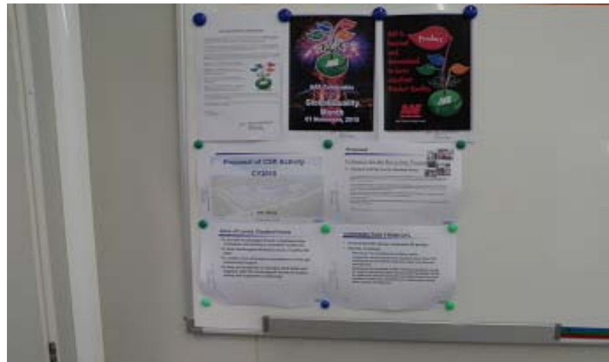
Display of Opening message, Global Quality Month logo, and Special Message at Main Office Lobby, Production area and Warehouse.