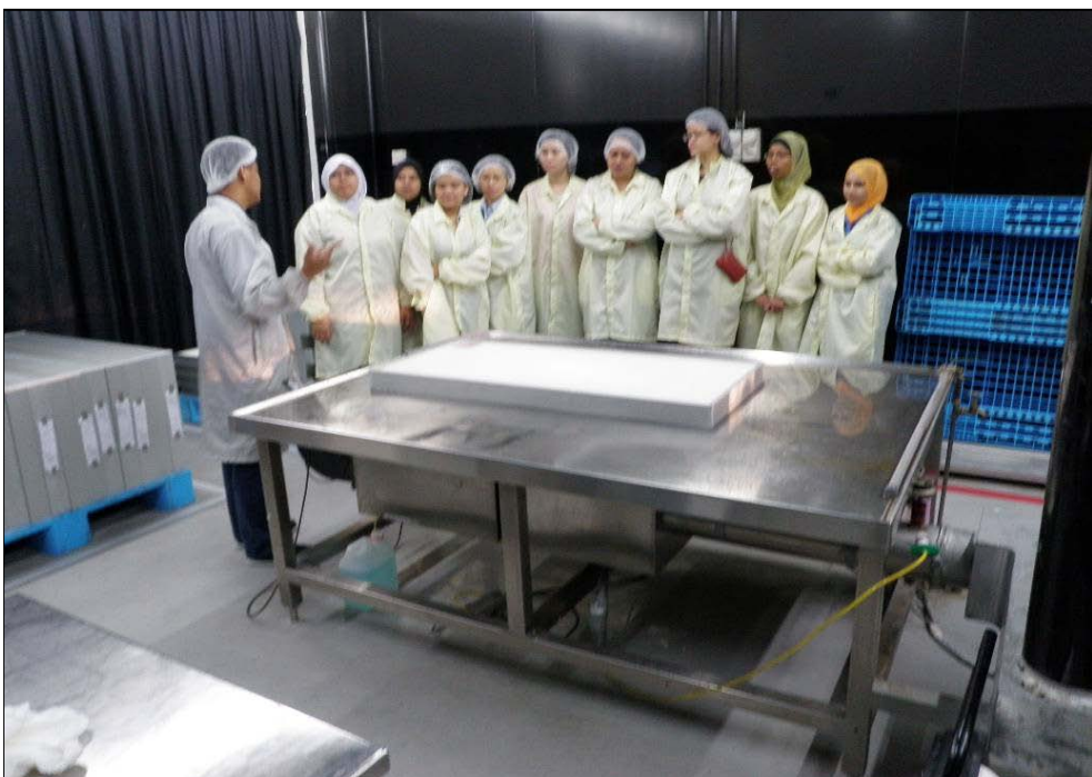
QC line leader sharing QA knowledge with participant on AstroCel-II DIN SCAN procedure.